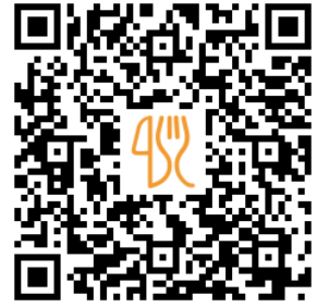
Tabla Ilford Menu