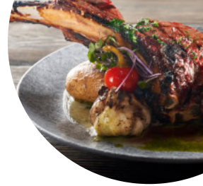
Tabla Iford Menu