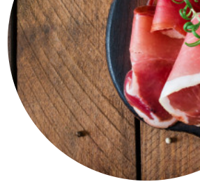
Table Forty One