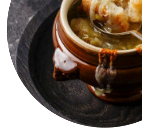
Table Forty One Menu