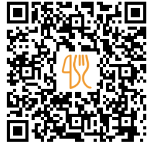
Table Forty One Menu

https://menuweb.menu 41 Main Street, Y25 E1X7 Gorey, Ireland +353539421366 - https://www.tablefortyone.ie/